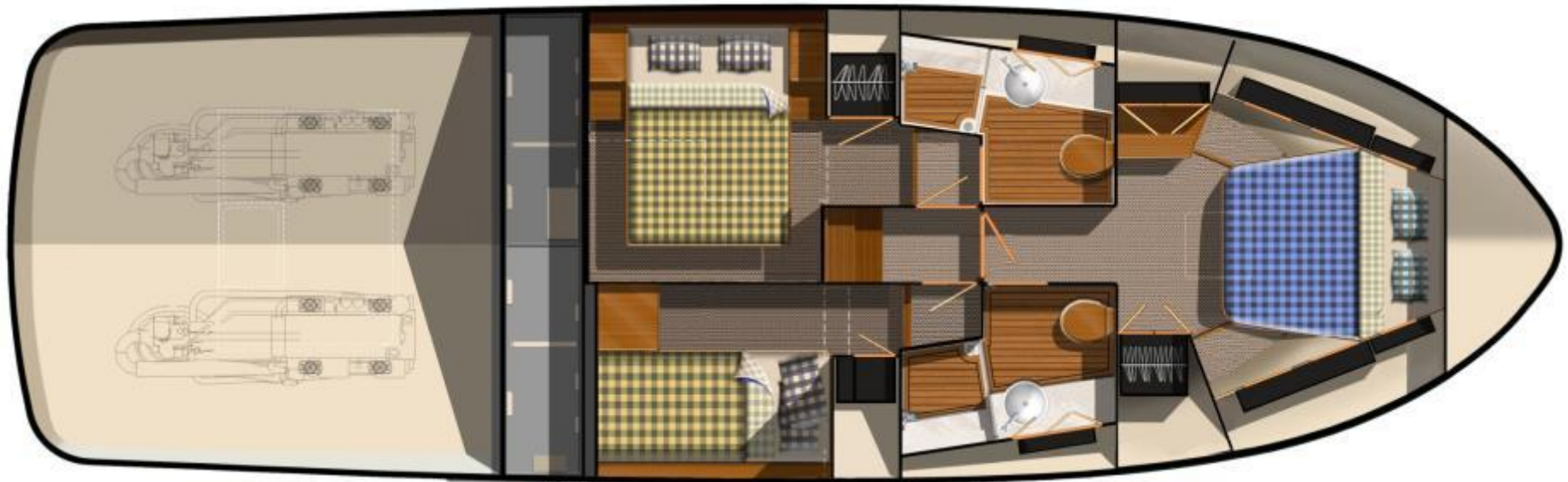
EB44 LOWER DECK OPTIONAL