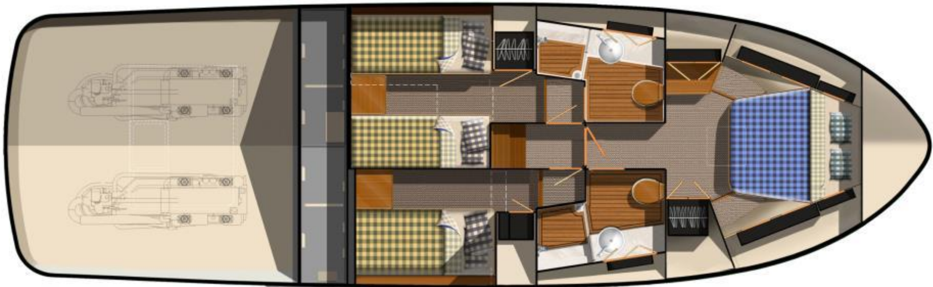
EB44 LOWER DECK STANDARD