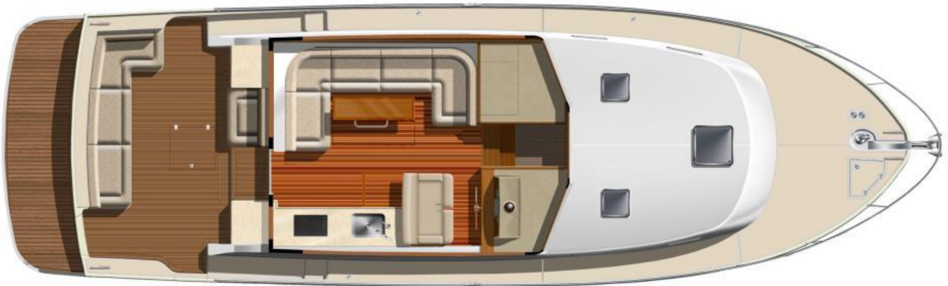
EB44 MAIN DECK LAYOUT